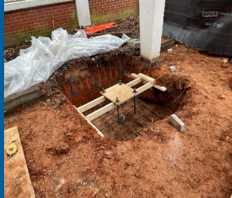
Excavation of footings and anchor bolts