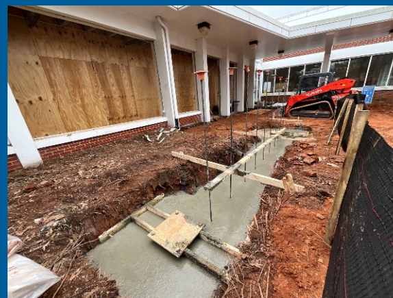
Vestibule Footings Poured