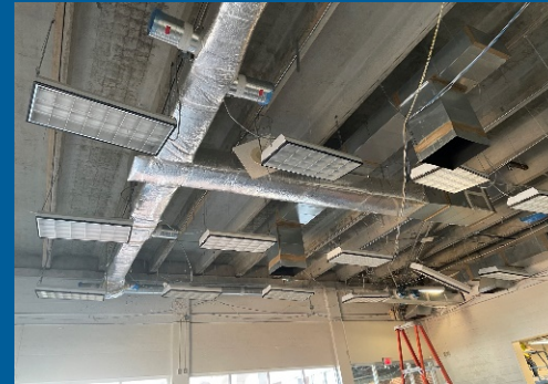
New Ductwork installed in cafeteria