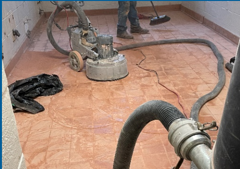
Floor prep for epoxy flooring