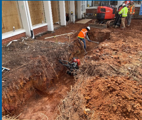
Vestibule Footings being excavated